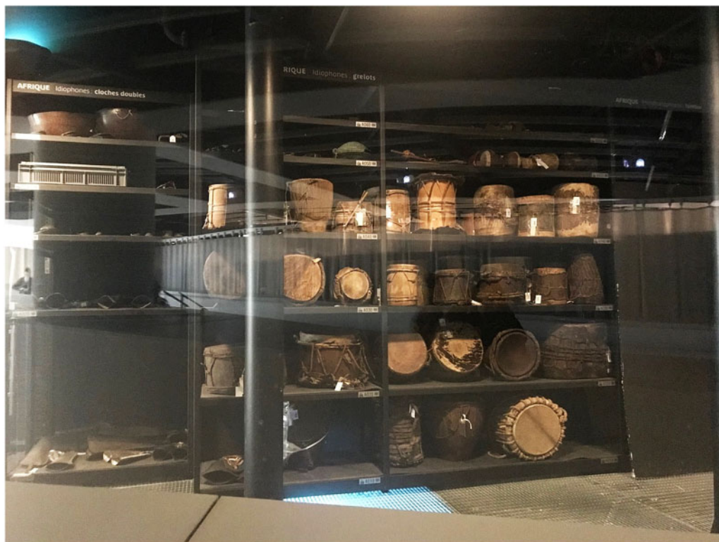
FIGURE 1: Musical instruments in the Open Storage area of the Musée du quai Branly, Paris.

roducing slavery to decolonize institutions that for centuries avoided addressing violence and trauma. In subtle or more explicit ways, slavery can be presented in these museums without dismantling longstanding racist narratives that ultimately portray European men as saviors and Africans as submissive subjects.