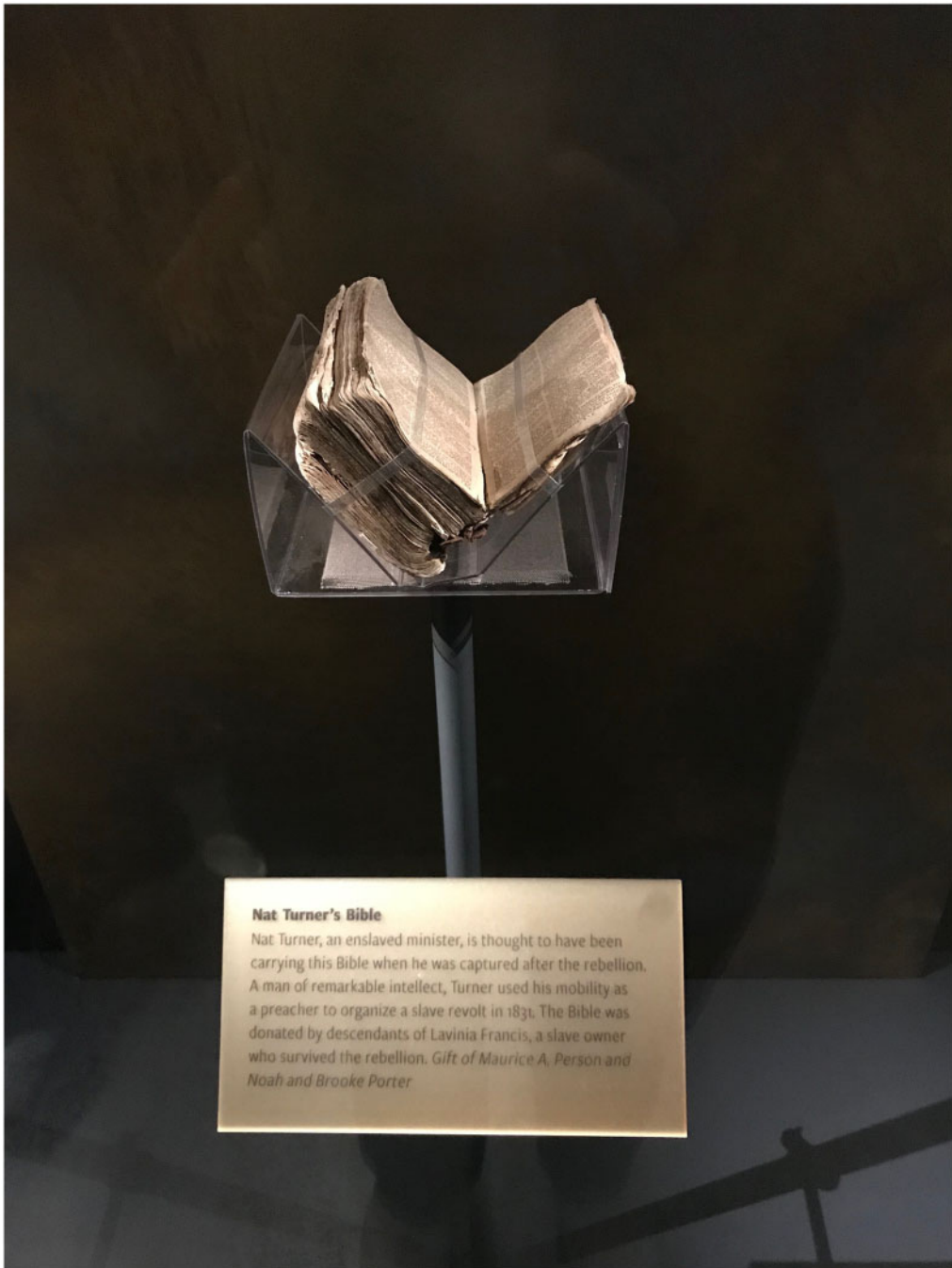
FIGURE 7: Nat Turner's Bible displayed in the exhibition Slavery and Freedom , National Museum of African American History and Culture, Washington, D.C.

Branly mentioned by Alice L. Conklin, I agree with Steven Conn that narratives in art museums work differently because they rely on visual language (artworks should stand by themselves) and not on verbal language. Art museums rarely require visitors to respect a particular path. Still, the various galleries of the Louvre Museum follow a certain chro-