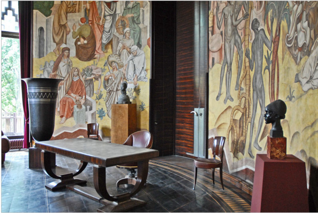
FIGURE 10: France's Cité nationale de l'histoire de l'immigration, opened in 2012, is housed inside the Palais de la Porte Dorée, built in 1931 for the Colonial Fair in Paris. The curators have preserved the monumental pro-empire art deco murals on the ground floor of the new museum, but they have not explicitly linked the history of colonialism to that of immigration. The galleries devoted to the history of immigration occupy the building's upper floors.

vided by the museum guides to the visitors. They also observed how the public engaged with the displays. Through the readings assigned in class, students were also able to examine the exhibition with critical lenses, by identifying existing gaps and areas where the inclusion of more details would have been appropriate to convey the complex history of slavery and the Atlantic slave trade. In addition, the study of the exhibition allows students to put themselves in the shoes of curators whose means to present this long history is limited by the space, resources, and available objects.