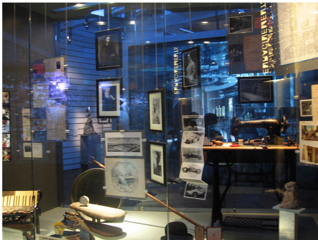
FIGURE 11: A museum of donated objects: immigration history at Paris's Cité nationale de l'histoire de l'immigration.

ralization in authoritative collections open to the public, race typology became part of a modern way of seeing difference.