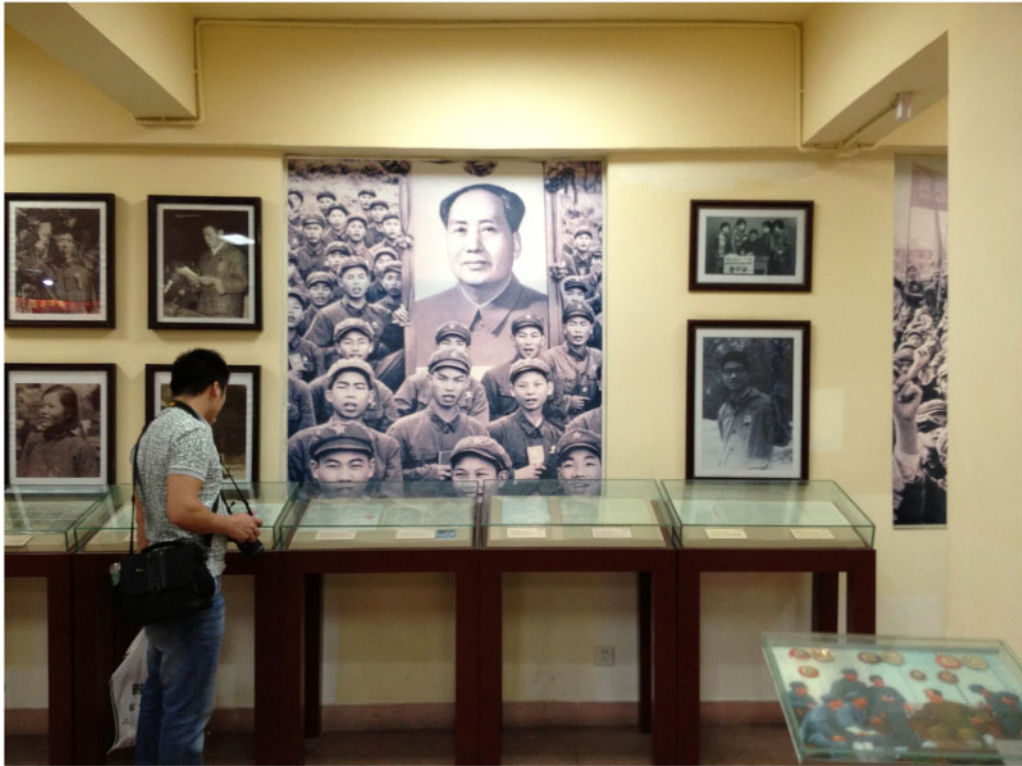
FIGURE 4: The Jianchuan Museum Cluster in Anren, Sichuan Province, is the largest private museum in China. Here, a visitor inspects Chairman Mao badges and related memorabilia.

metal detector. Reform and Opening Up is an exhibition by and for the Party, and that is why the entrance is designed for group photos and the final room is large enough to take a group loyalty oath.