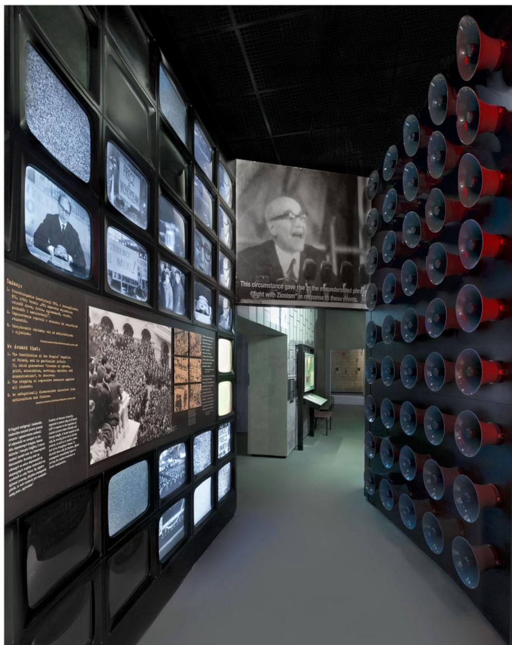
FIGURE 5: March '68 state-sponsored antisemitic campaign, installation in the Core Exhibition, Polin Museum of the History of Polish Jews.

search, itself under attack as anti-Polish. 18 According to current historical policy, the emphasis should be on the German perpetrators and on Polish suffering—and on the efforts of Poles, on pain of death, to help Jews during the Holocaust.