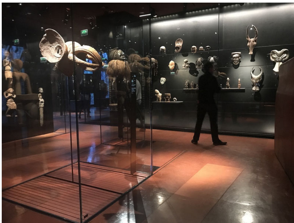
FIGURE 8: African permanent exhibition, Musée du quai Branly, Paris.

nological order, starting with Near Eastern Antiquities, Mesopotamia, and Iran (500 B.C.–A.D. 700) and passing through Egyptian Antiquities (4000–30 B.C.) and Greek and Roman Antiquities until reaching the more recent galleries focusing on U.S. and European painting of the middle of the nineteenth century. Here, as in most art museums, the artworks speak for themselves, and unless the visitor chooses to take an audio guide, textual descriptions are limited to descriptive labels and some panels introducing each gallery. In the case of Quai Branly, this narrative is even more obscure or confusing. Relying on an aestheticizing approach to arts of Africa, Asia, Oceania, and the Americas, the permanent exhibitions neither follow a trajectory nor respect any hierarchy. Visitors can rarely find a detailed description of an object: whereas French guests can understand that most of those objects were incorporated into the museum's collections during the French rule in parts of Africa, Asia, and Oceania, there is rarely any information about contentious acquisitions, and this decontextualized approach tends to drive away foreign visitors who are not familiar with French colonialism. How do other community members see and engage with this museum? African immigrants and Afro-French citizens certainly visit the museum, but they are not represented on its board of trustees. Though the museum employs several black individuals, none of them are curators.