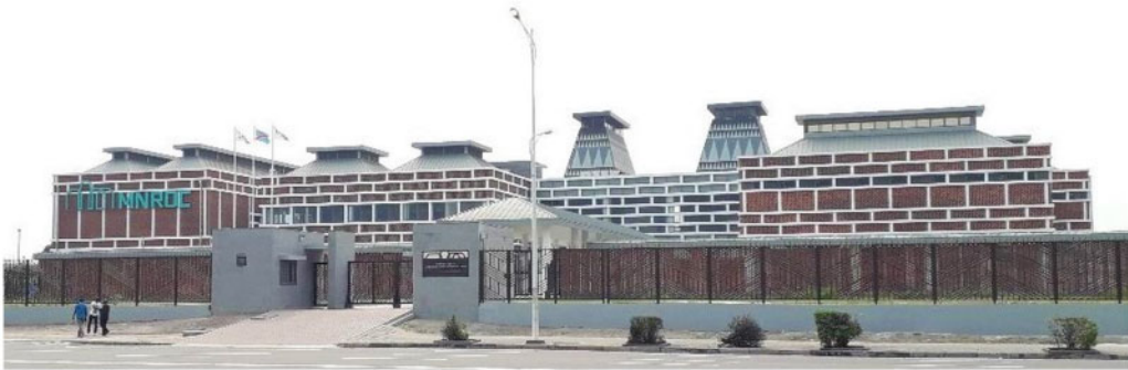
FIGURE 6: In some parts of Sub-Saharan West and Central Africa, new museums are opening with help from Asian nations. A recent example is the National Museum of the Democratic Republic of Congo in Kinshasa, co-financed by Korea and inaugurated in June 2019. For more on the long history of collecting in what was formerly the Belgian Congo, see Sarah Van Beurden's review in this issue.

perceiving, knowing, and interpreting has been more difficult. Even when the will is there in European capitals, numerous impediments remain. On a purely practical level, in Europe itself, curators who seek to acquire the deep local knowledge of shifting African cultural practices under colonialism—that they might finally properly contextualize how, for example, specific objects now in European collections might carry a story of resistance—do not usually have the training or other resources needed to recover this past.