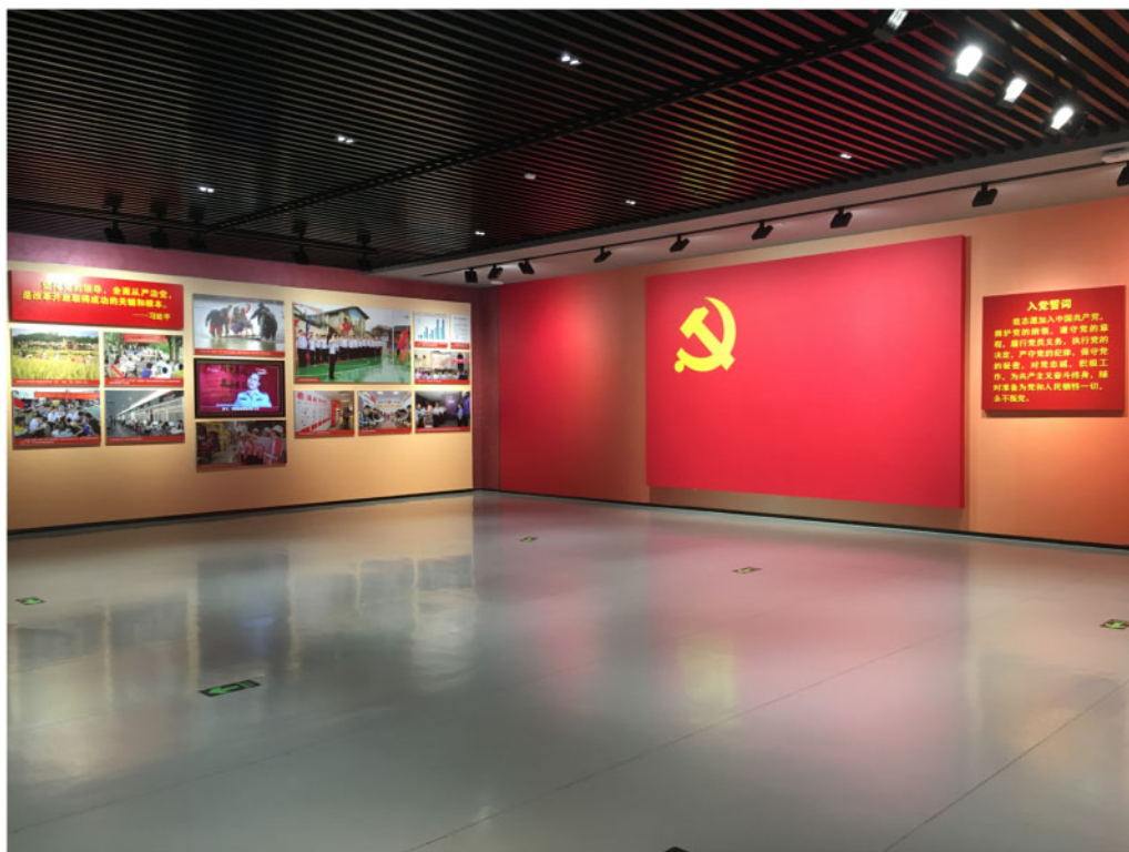
FIGURE 3: One room in the exhibition Reform and Opening Up is designed to initiate new members to the Communist Party. Next to the CCP flag is the oath for entering the Party.

policy had its fortieth anniversary, and its watchwords (and undeniable achievements) form the crux of the Communist Party's present-day ideology. Shenzhen's cityscape is embedded with symbols of "reform and opening" and its architect, the paramount leader Deng Xiaoping. One of the most prominent landmarks is a billboard with Deng's image and slogan, and in the main city center a public art piece simply reads: "Fortieth Anniversary," with the subject implied. Outside of the Design Society museum, a visitor literally ascends a narrowing staircase with 1978 at the bottom and arrives at 2018 at the top, dwarfed by an enormous red flag with a hammer and sickle.